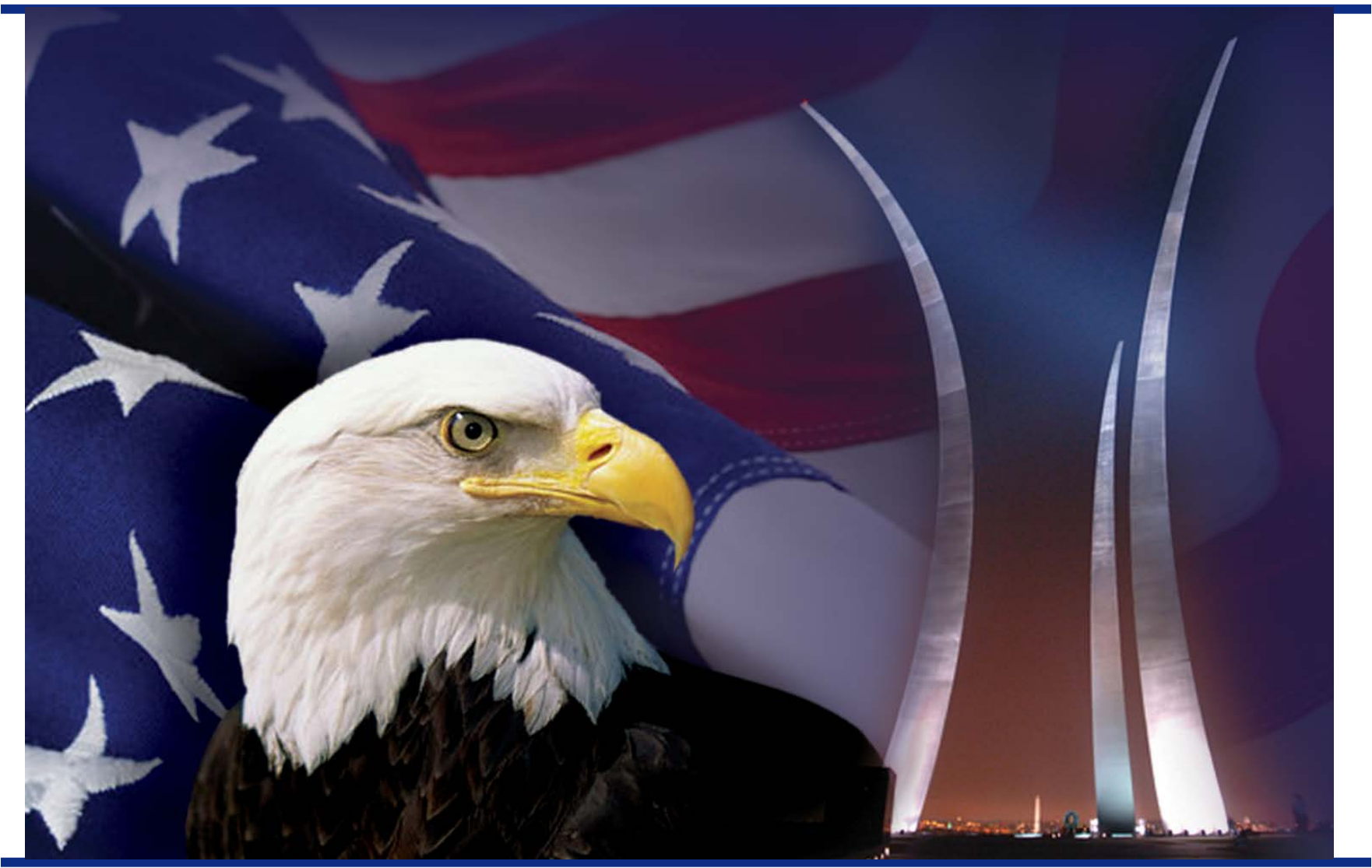
Integrity - Service - Excellence